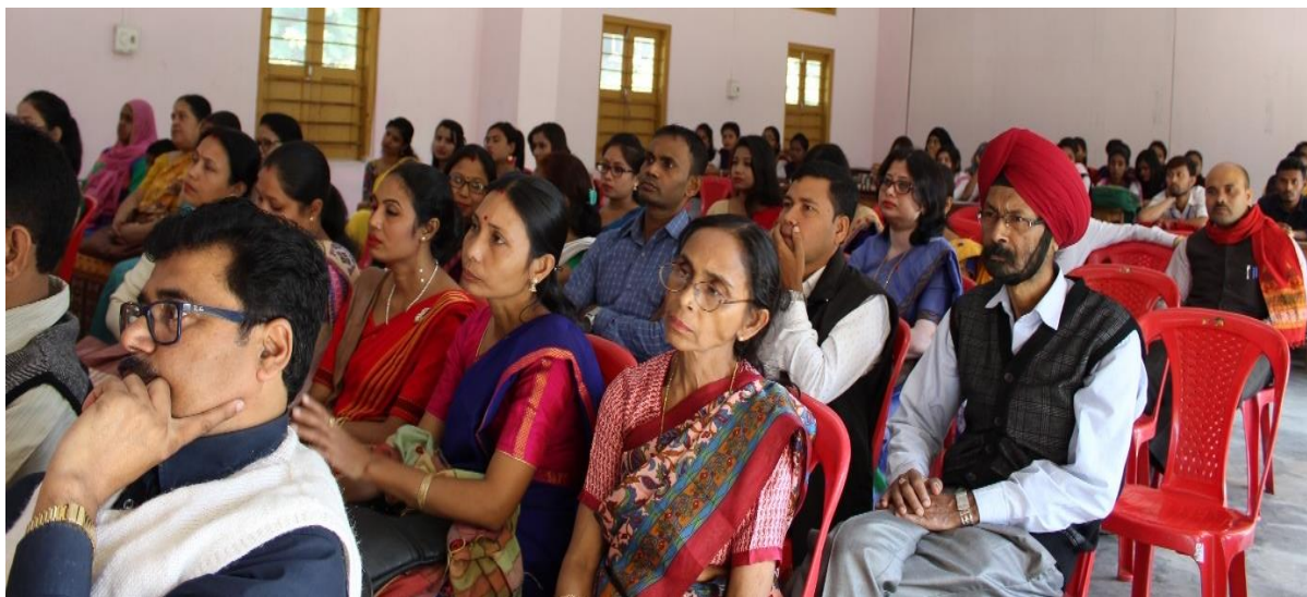
Figure 4: A glimpse of the audience in the programme