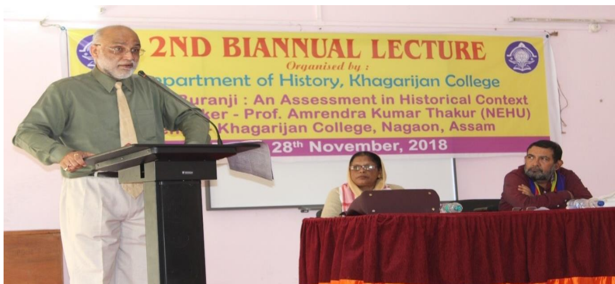
Figure 3: Resource Person delivering keynote address