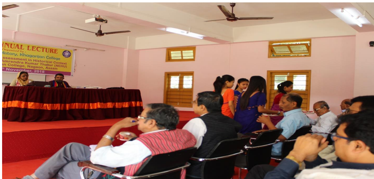
Figure 5: Light Refreshments in the session