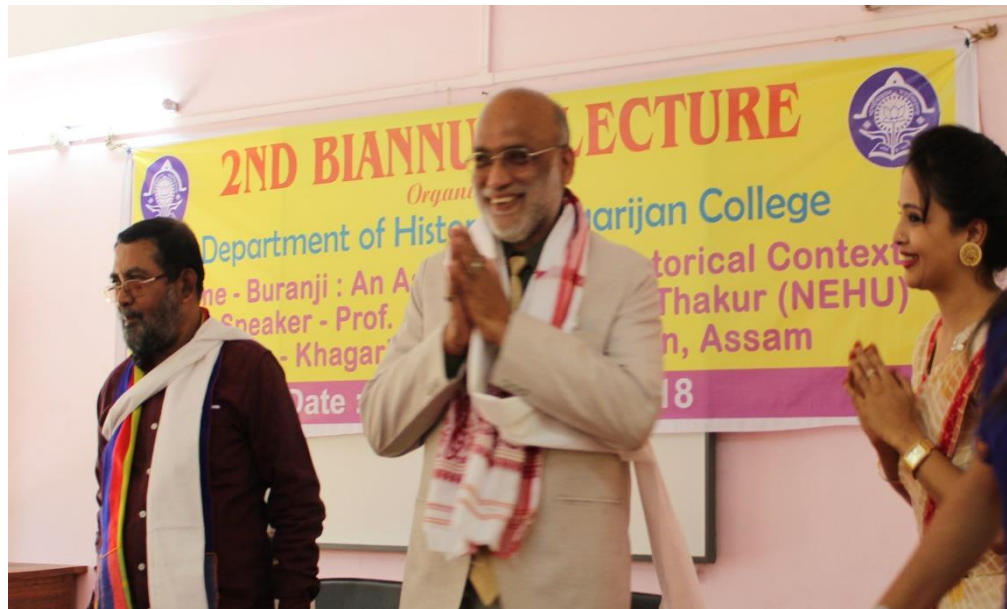
Figure 2: Felicitation Ceremony