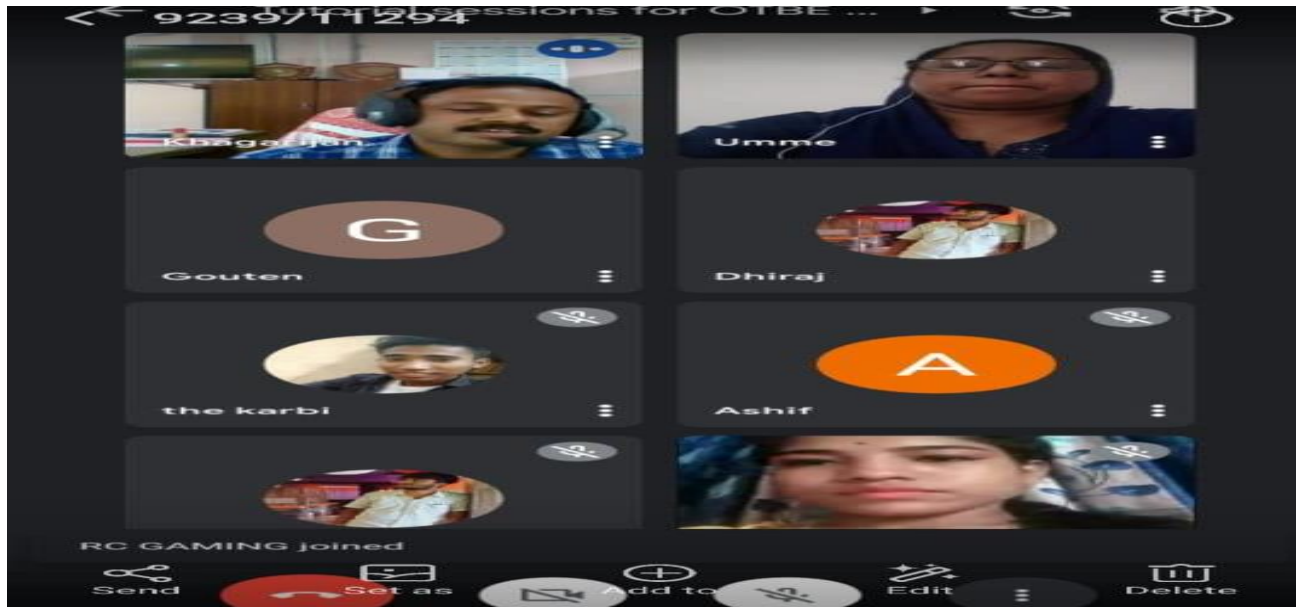
FIGURE 9: SCREENSHOT OF THE OTBE TRAINING SESSION