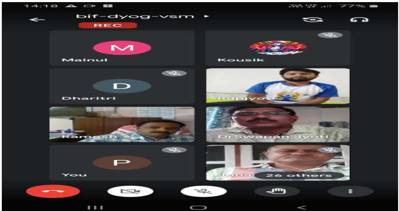
FIGURE 7: SCREENSHOT OF THE ONLINE WORKSHOP ON BUILDING MENTAL AND

A two-day Online Yoga Workshop on “Building Mental & Physical Health” was organized by Department of Assamese and NSS unit, Khagarijan College, Nagaon in association with Arogya Yoga Kendra, Dhing, and Nagaon on 27 th and 28 th June, 2021.