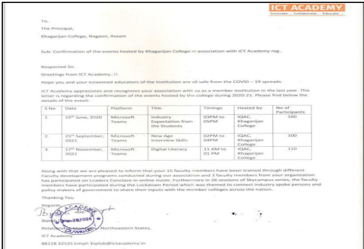
FIGURE 11: LIST OF EVENTS IN COLLABORATION WITH ICT ACADEMY

On 20/08/2021, a MoU was signed by Khagarijan College, Nagaon, Assam and ICT Academy to venture into a platform of mutual cooperation and contribution towards a digital space of e-learning as well as e-teaching for the students and faculty members respectively . Under this MoU, several programmes and initiatives were organized. On 15/06/2020, an online event was hosted by IQAC, Khagarijan College, Nagaon, Assam in collaboration with ICT Academy on the topic, “Industry Expectations from the Students” which witnessed a participation of 100 students. On 25/09/2021, a webinar was hosted by IQAC, Khagarijan College, and Nagaon, Assam in collaboration with ICT Academy on the topic, “ New Age Interview Skills ” which witnessed a participation of 100 students. On 17/11/2021, an online event was hosted by IQAC, Khagarijan College, and Nagaon, Assam in collaboration with ICT Academy on the topic, “Digital Literacy” which witnessed a participation of 110 students.