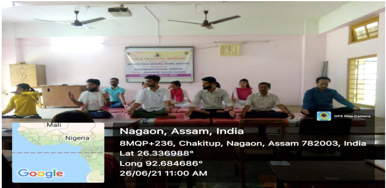
FIGURE 2: YOGA TRAINING SESSION