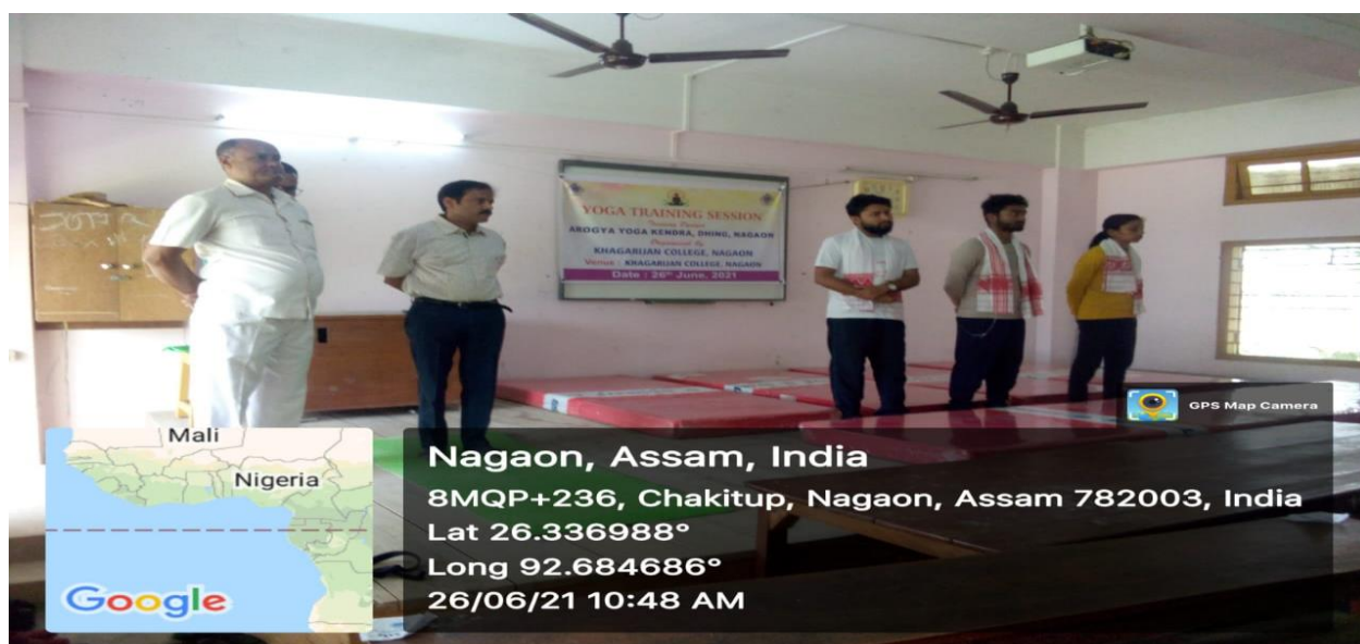
FIGURE 5: INAUGURATION OF THE YOGA TRAINING SESSION

Khagarijan College, Nagaon, Assam and Arogya Yoga Kendra, Dhing, Nagaon signed a MoU 01/07/2020. The main objective of this MoU is to collaborate on various initiatives to improve the health and fitness of the college population; including, students, faculty and other staff members. On 26/06/2021, a Yoga Training Session was organized by Khagarijan College, Nagaon and Arogya Yoga Kendra in Room No 5 in the college.