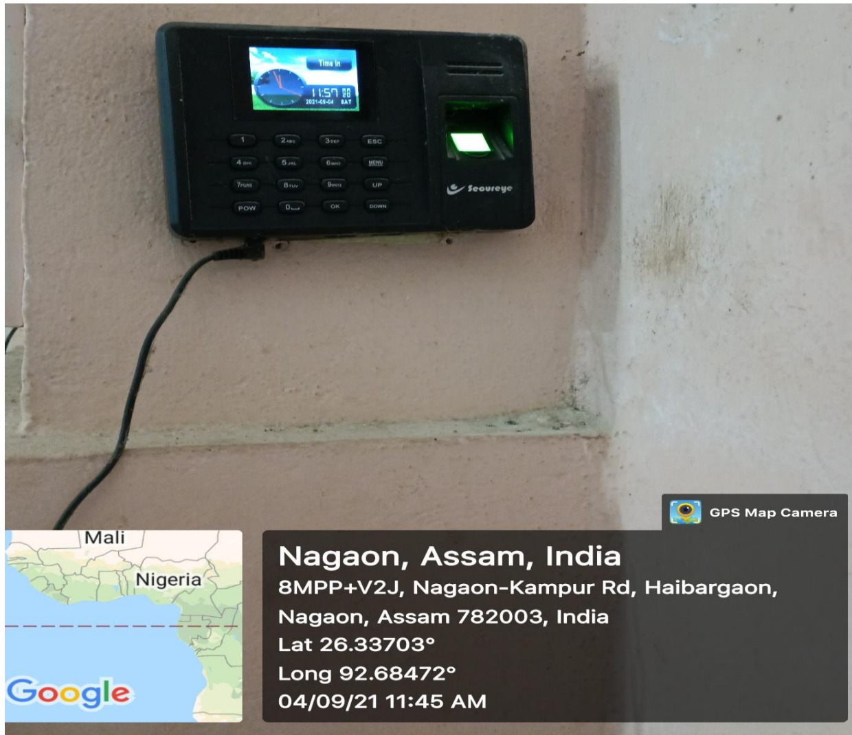
Figure 2: Biometric Attendance System

Attendance of the Faculty Members is supervised by the Biometric scanner which is placed in the Principal's Office. All the faculty members are duty bound to report through the scanner to announce their reporting time in the college campus. This helps to maintain strict office timings and give rise to efficient work.