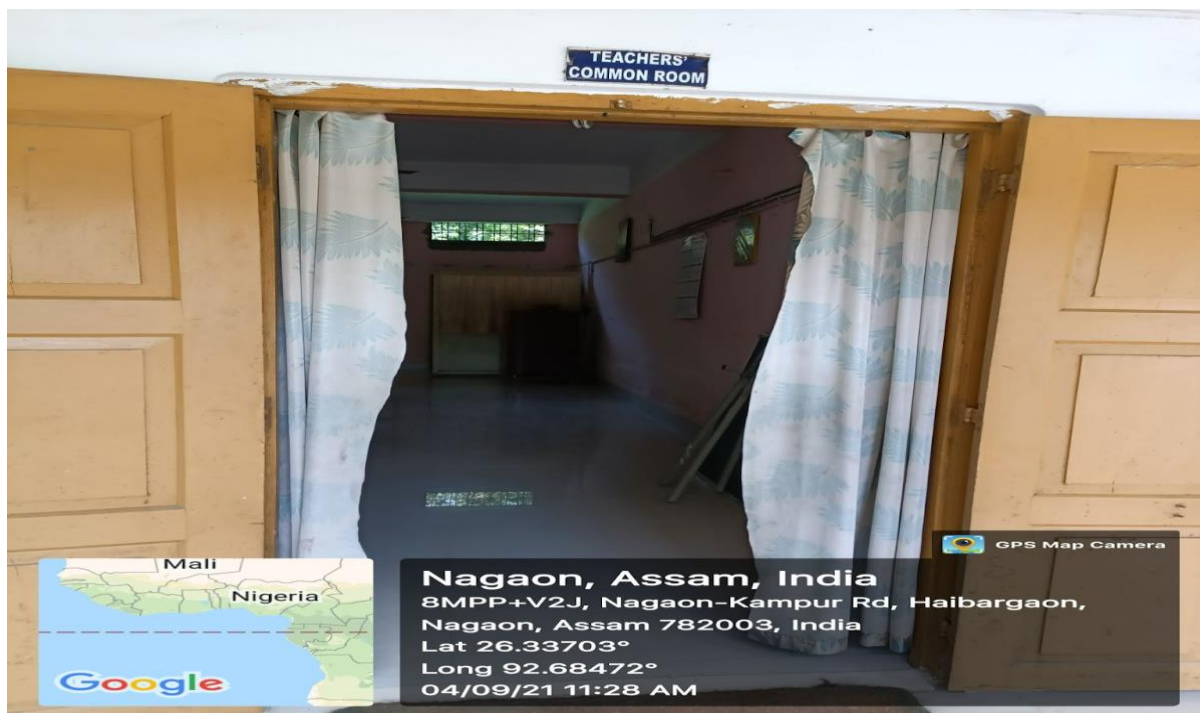
Figure 1: Common room for teaching staff

There is a Teachers' Common Room facility in the college to encourage Faculty interaction as well as provide a venue for faculty meetings and discussion. The recreation facility is also present with an operational Television Set available in the Common Room. Further, it also provides a clean drinking water facility, Refrigerator facility as well as Rest rooms for both male and female faculty.