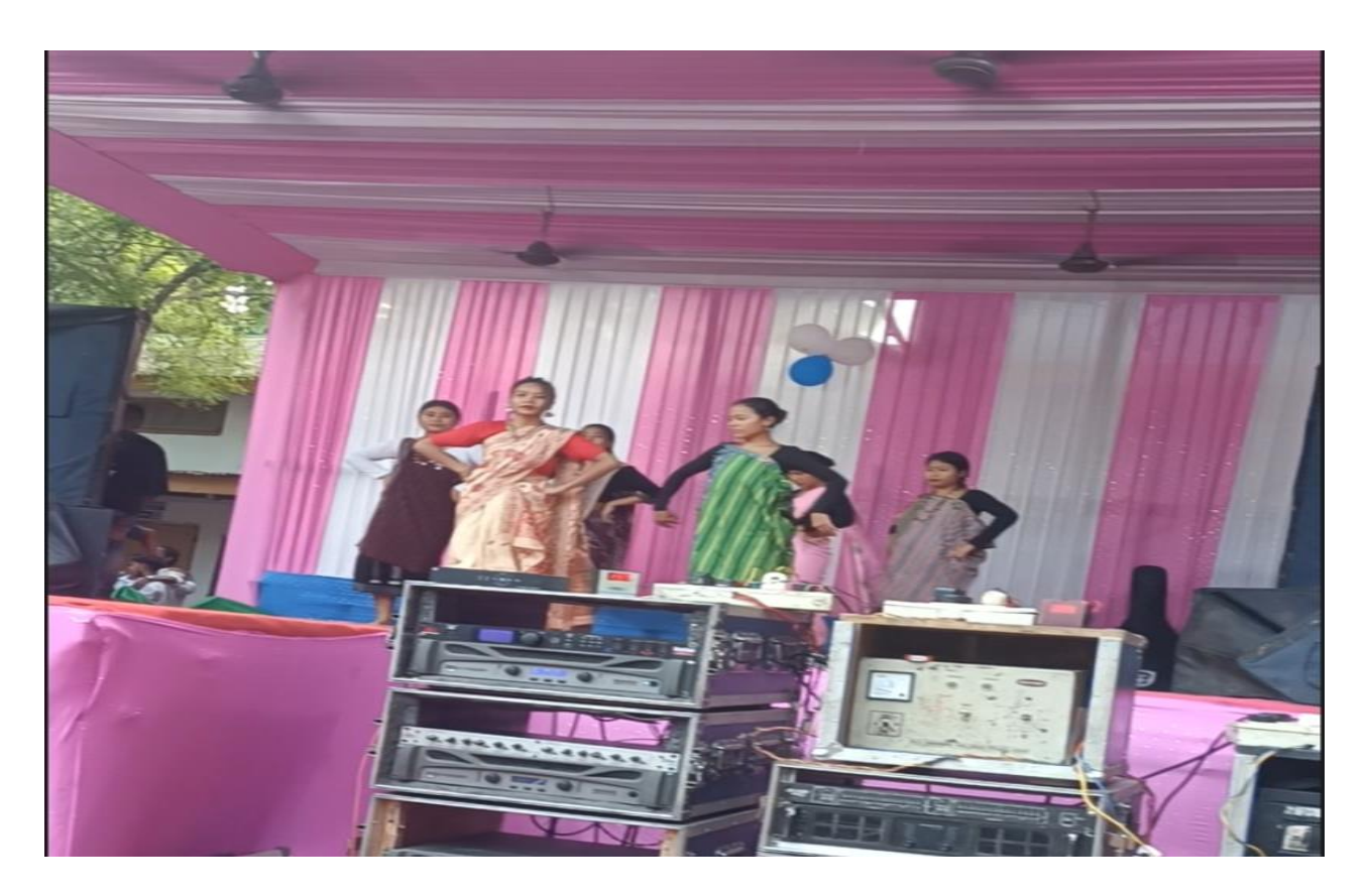
Figure 3 Group Dance