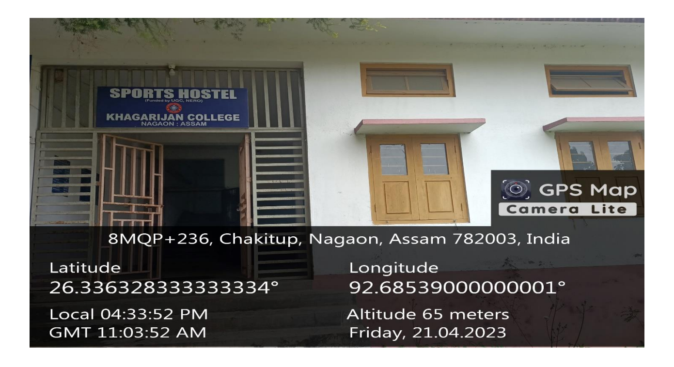
Figure 9 : Sports Hostel in the College