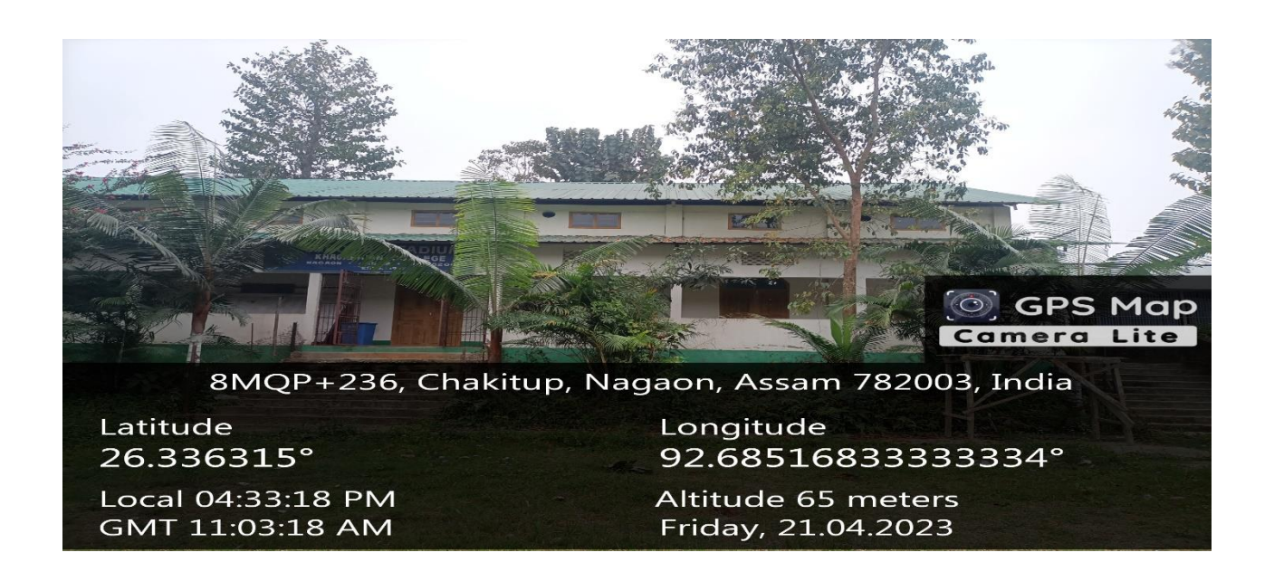
Figure 7: Indoor Stadium of the College (Outside)