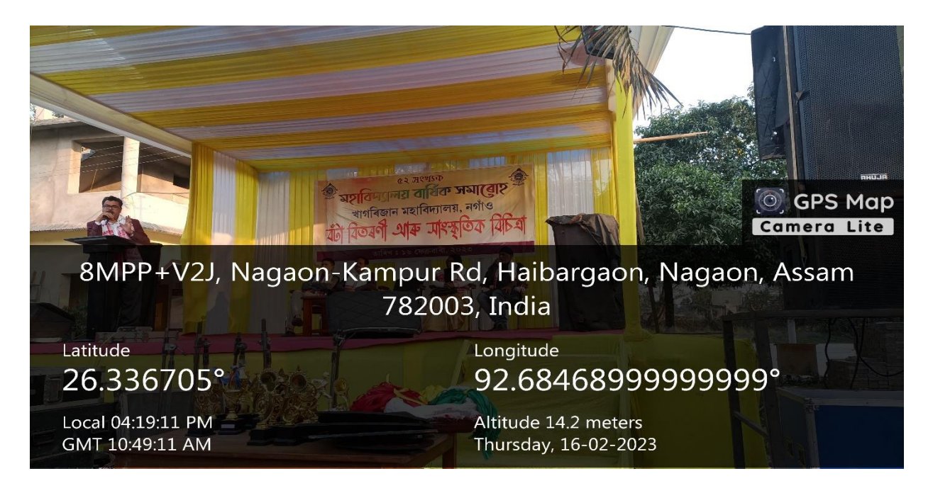
Figure 1 College Week

4.1.2 - The Institution has adequate facilities for cultural activities, sports, games (indoor, outdoor), gymnasium, yoga centre etc.