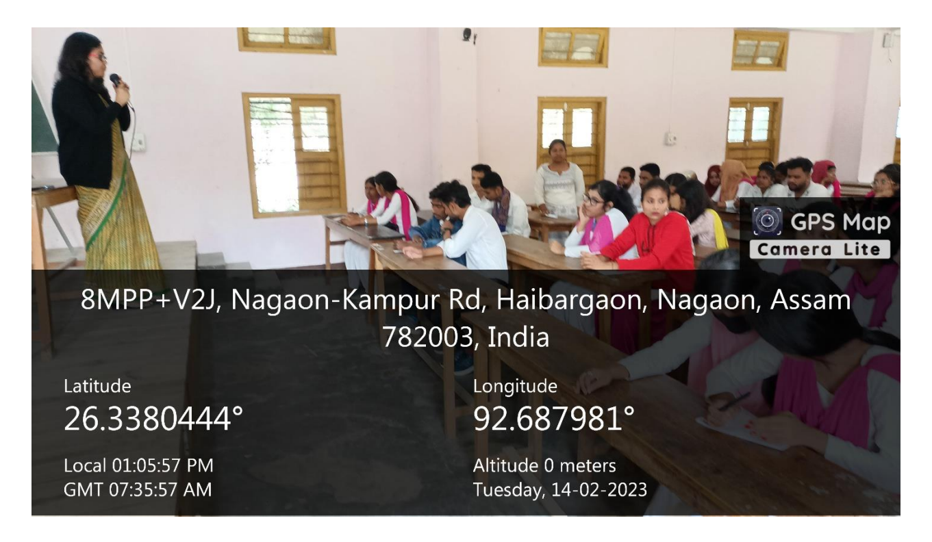
Figure 6 Quiz Competition on the occasion of College Week