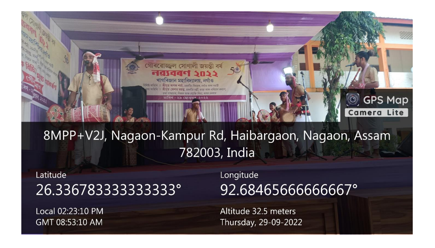
Figure 2: Cultural Program on 29th September, 2022 on the occasion of Freshmen Social