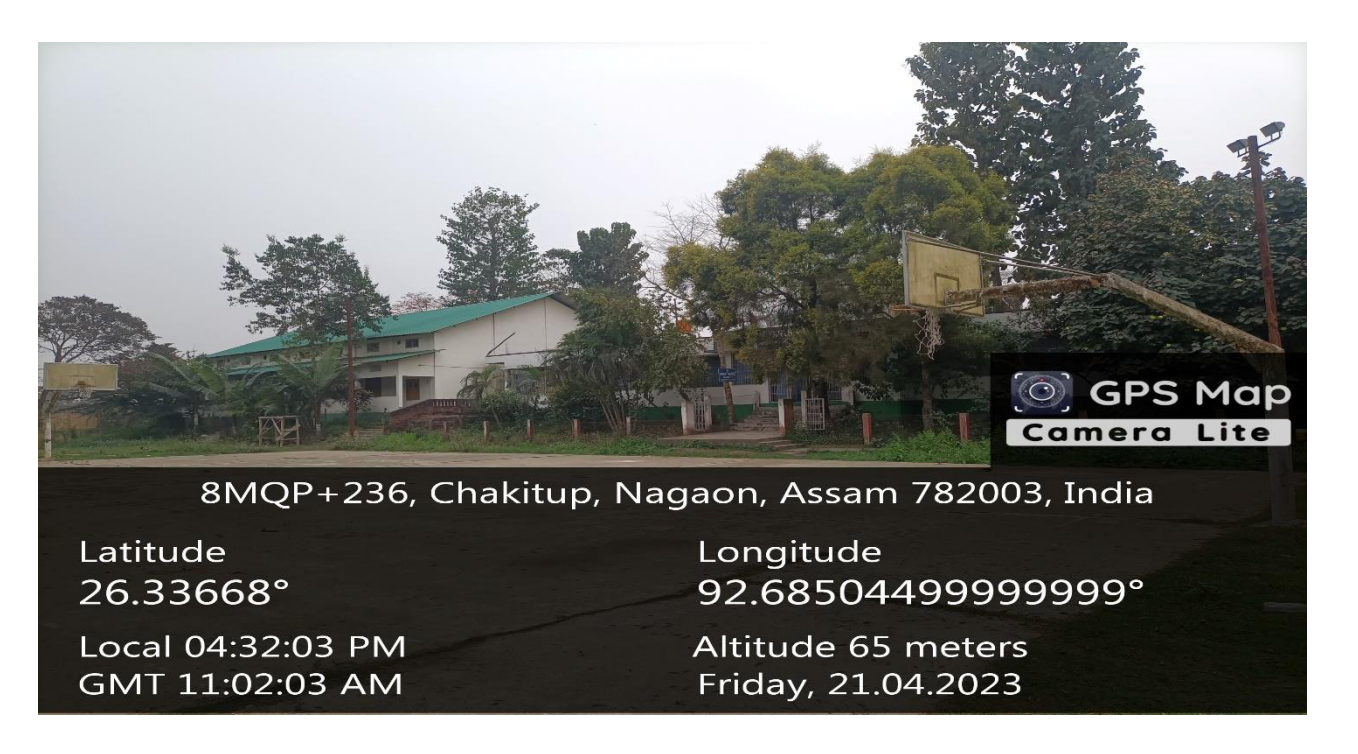
Figure 11 Basketball Court in the College Campus