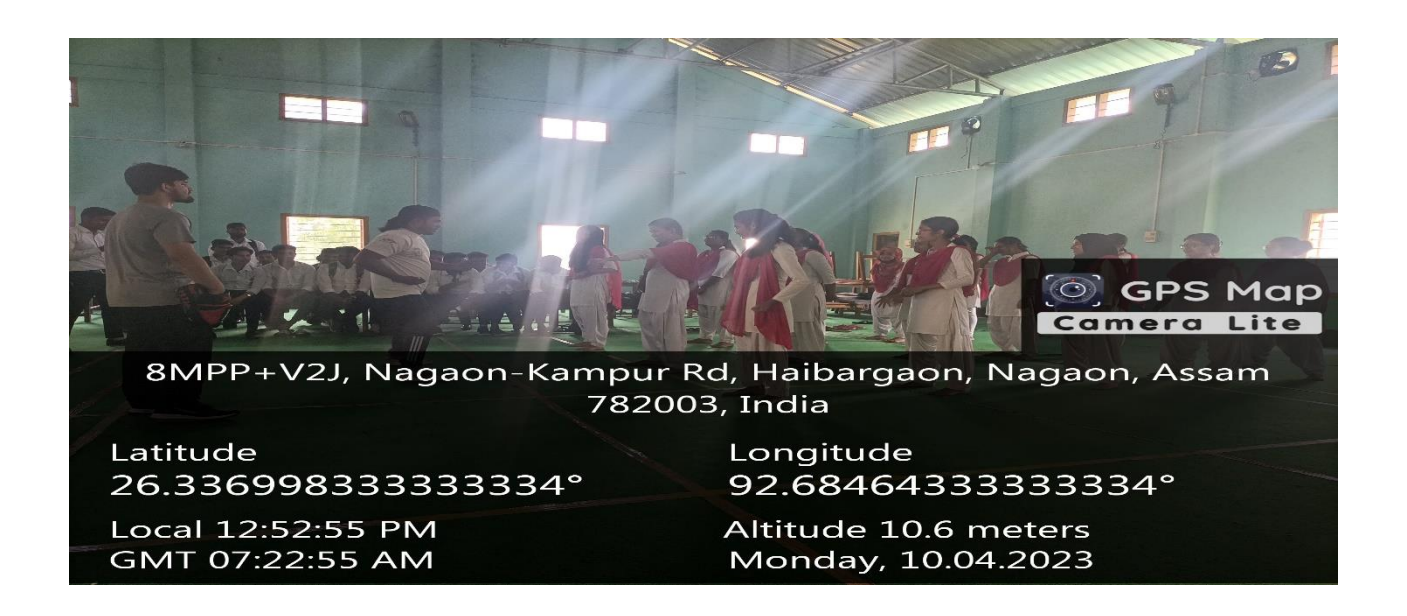
Figure 8: Indoor Stadium (Inside)