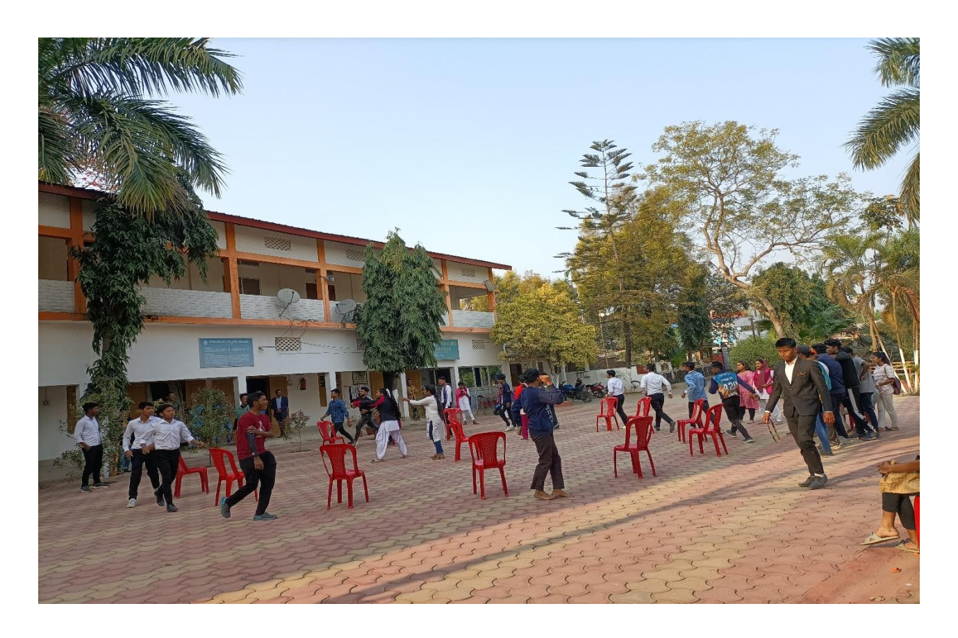
Figure 5 Musical Chair Competition on the Occasion of College Week