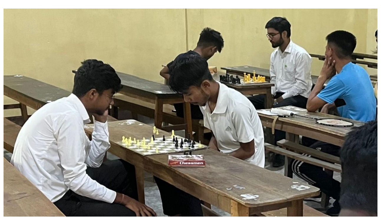
Figure 4 Indoor Game