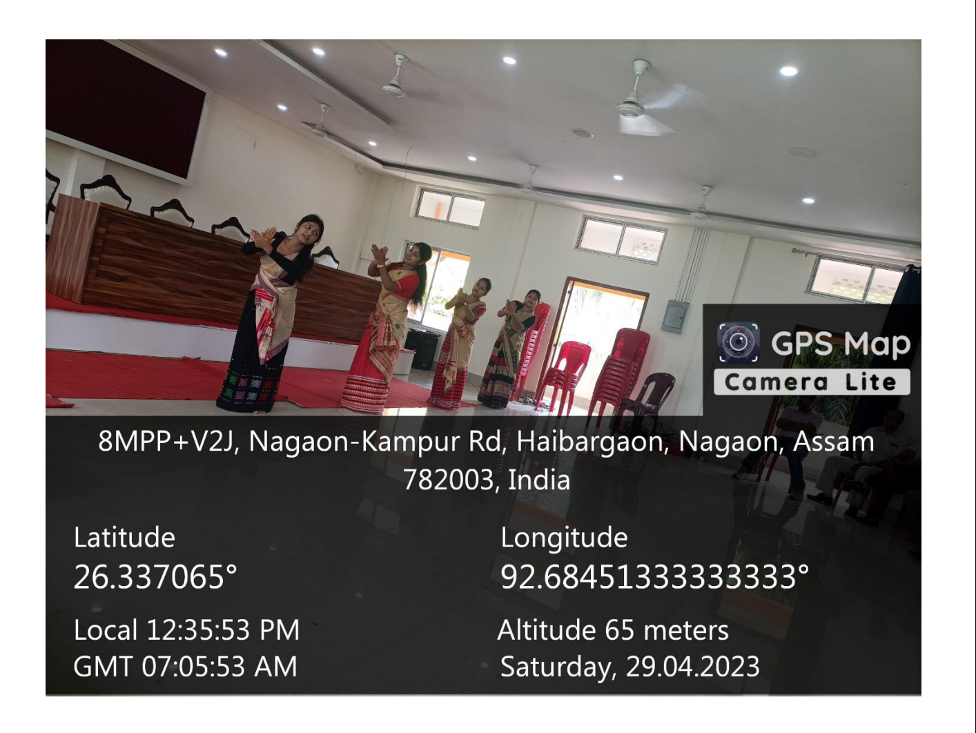
Figure 15 Group Dance Performance at Conference Hall