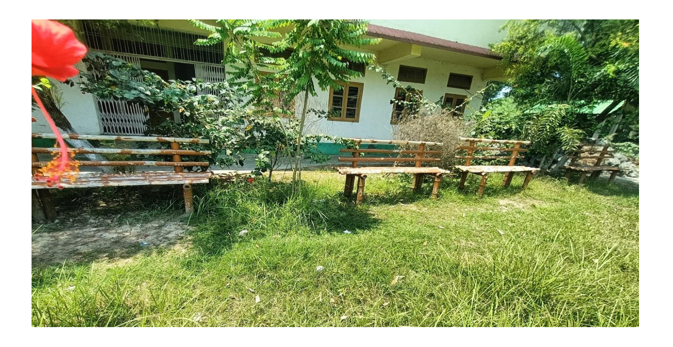
Figure 14: Sitting Area in the College