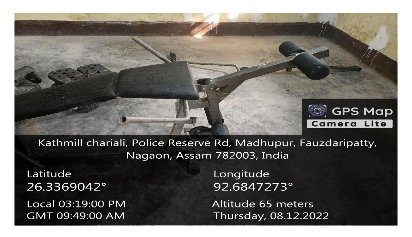
Figure 12 Gym Centre